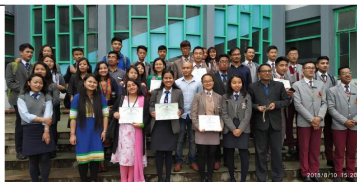
Awareness talk on Minimalism and Sustainable lifestyle at Capital Hall