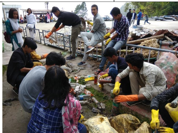
Made EcoBricks from the plastics collected