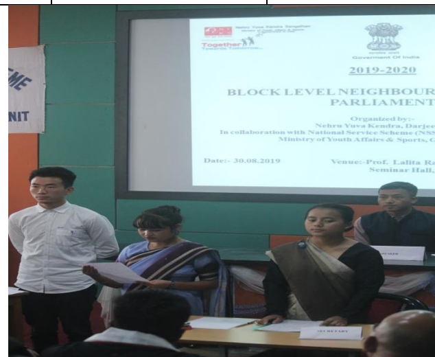
Awareness programs of menstrual health and hygeine